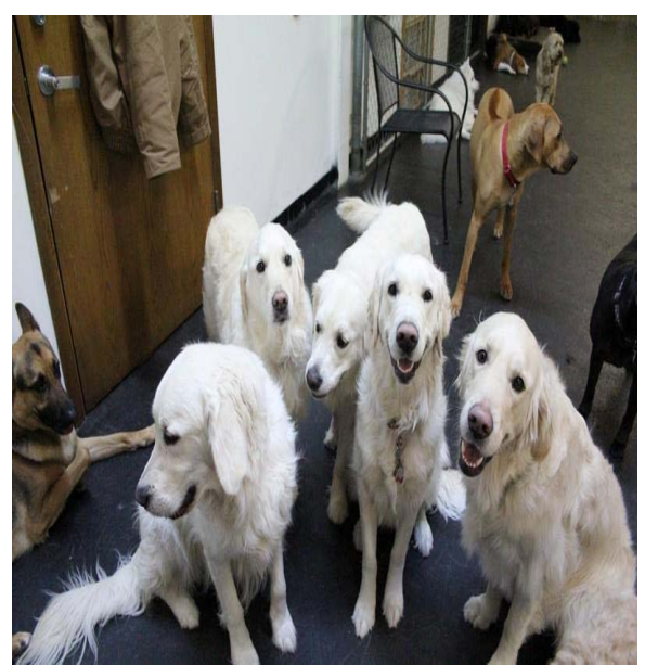
WE LOVE THIS PIC, THOUGHT YOU MIGHT TOO.